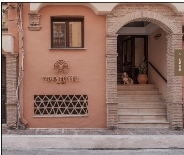
Figure 1: The entrance to the Yria Hotel

Participants should bring clothes and toiletries suitable for warm and sunny weather (26 -36°C), but should also prepare for rainy, windy, and chilly days. Zakynthos offers a lot of opportunities for sports and entertainment. Possible leisure activities during the siesta and days off are swimming, sunbathing, surfing, scuba diving, fishing, and sailing.