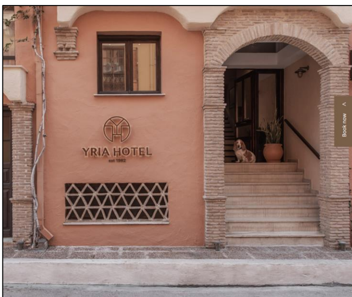
Figure 1: The entrance to the Yria Hotel